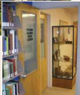
This partial interior view of the Pitcairn Islands Study Center shows some of the library and a few of the Pitcairn artefacts which are on display.

A call for papers has been issued. Individuals interested in speaking for up to 30 minutes on a Bounty - or Pitcairn-related topic are requested to contact the conference organizers via e-mail at 2012bpc@gmail.com or via post to Herb Ford, Pitcairn Islands Study Center, Nelson Memorial Library, Pacific Union College, 1 Angwin Avenue, Angwin, CA 94508-9713. Further details about the conference are available online at www.2012BPC.com . ■