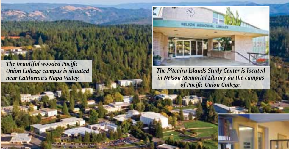
The beautiful wooded Pacific Union College campus is situated near California's Napa Valley.