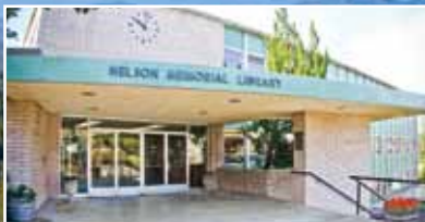
The Pitcairn Islands Study Center is located in Nelson Memorial Library on the campus of Pacific Union College.