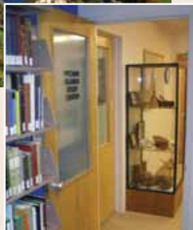
This partial interior view of the Pitcairn Islands Study Center shows some of the library and a few of the Pitcairn artefacts which are on display.