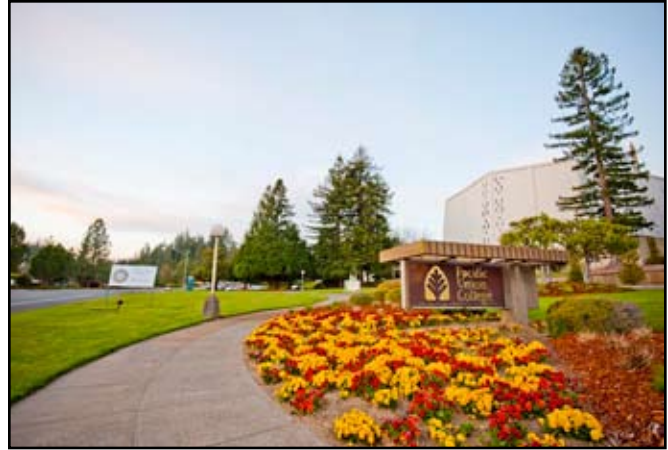
A sign announcing the Pacific Union College. The campus is set in a manicured garden along the main thoroughfare of Angwin in California's beautiful Napa Valley.