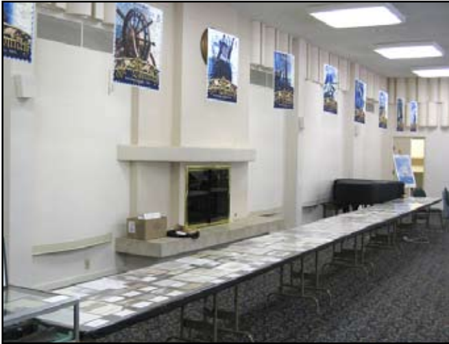
Along one wall of the Fireside Room can be seen the long table with historical displays. Hanging from the ceiling are blowups of the latest Pitcairn Bounty detail definitives.