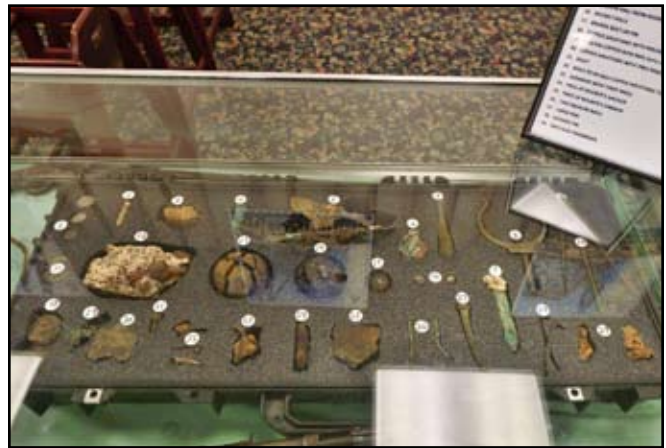
Maritime and Bounty collector Tony Probst's amazing display of Bounty artifacts was enjoyed by all.

A total of 113 other items of historical and photographic interest were also displayed on a 50-foot row of tables along one wall of the Fireside Room. Dominating the upper reaches and stretching completely across one side of the large room were 12 full-color enlargements of Pitcairn's 10th definitive series, showing details of the Bounty . The entire room was filled with Pitcairn-related paintings, photographs and even a large tapa cloth, "Niau's Hideout," created by